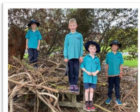
MPS Playground Builders and Architects