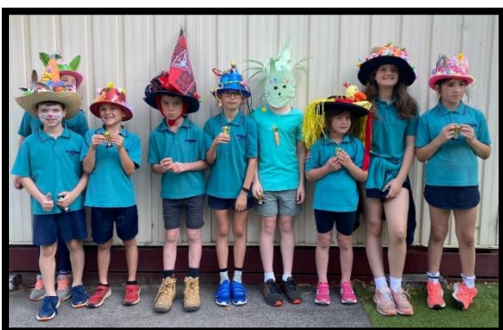
2023 Easter Hat Parade Winners