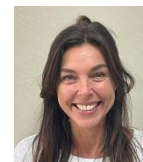
Celeste Amenta Art