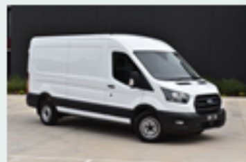
New Fiction in the MARC van